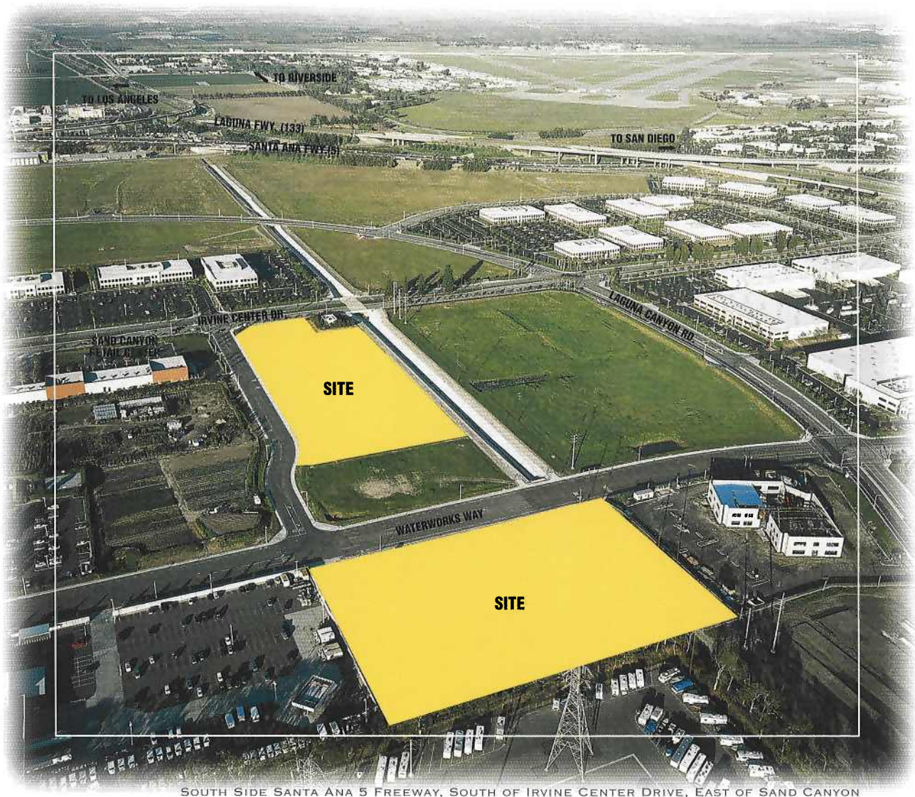
SOUTH SIDE SANTA ANA 5 FREEWAY, SOUTH OF IRVINE CENTER DRIVE, EAST OF SAND CANYON